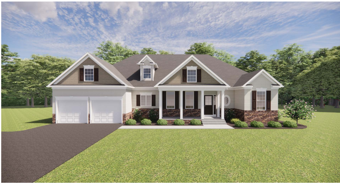
ELEVATION D3 Porch w/Stone to Window