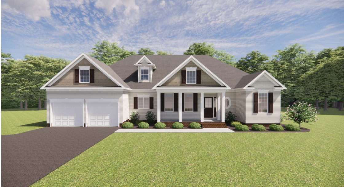
ELEVATION A1 Porch w/Brick to Grade