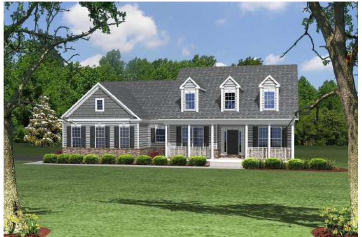
ELEVATION D2 SHOWN W. OPTIONAL SIDE LOAD