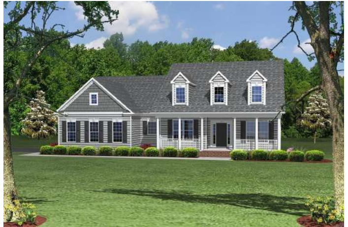
ELEVATION A2 SHOWN W. OPTIONAL SIDE LOAD